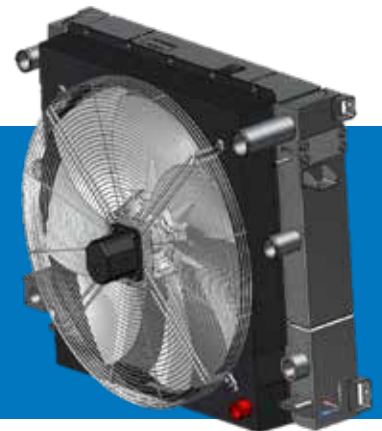
Radiators, charge-air and oil coolers with fan cowl, fan and hydrostatic drive