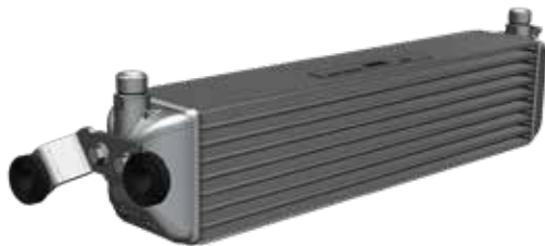
Transmission oil cooler