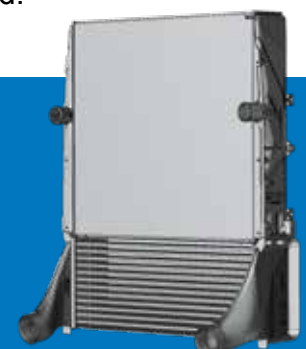
Radiator / charge-air cooler