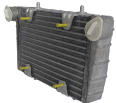
Auxiliary oil cooler