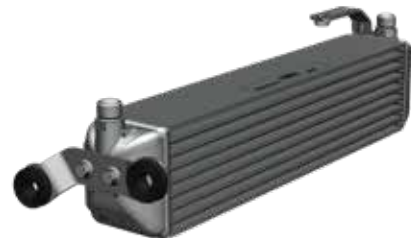
Transmission oil cooler